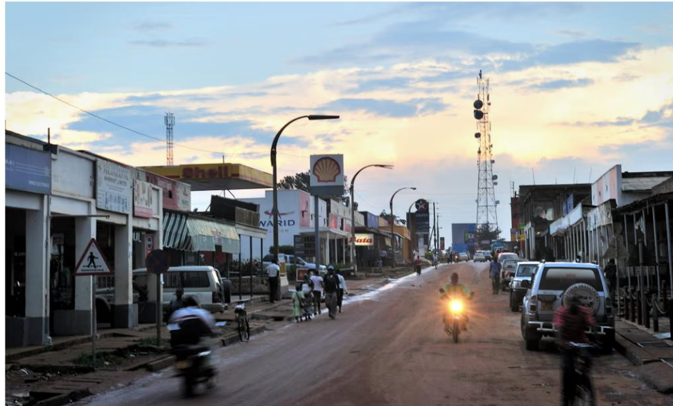
Gulu, northern Uganda's largest city, is home to a large business process outsourcing centre.

Social media content and AI training data are processed in outsource centres in the global south, where long hours, low pay and exposure to disturbing material are the norm